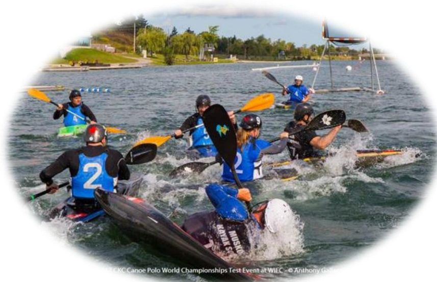
Canoe Polo World Championships Test Event at WLEC

2018 ICF World Championships Host Organizing Committee